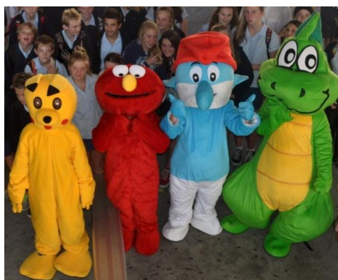
Our new "House Mascots"