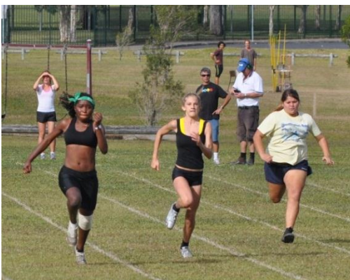
U/16 Girls 100m sprint