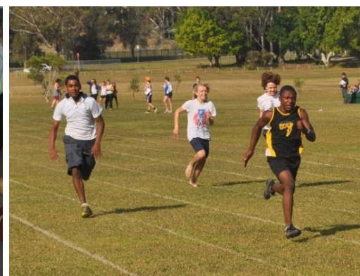
U/14 Boys 100m sprint